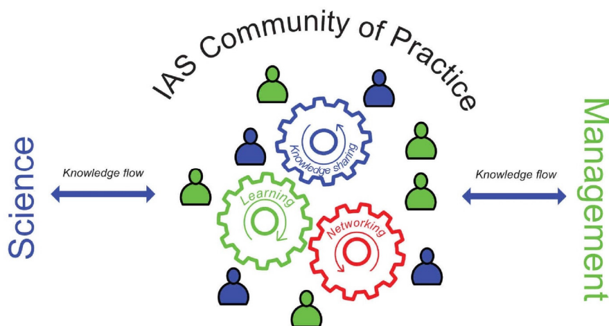
Figure 1. Knowledge flows among IAS Community of Practice, Science and Management.

“risk analysis” refers to: (1) the assessment of the consequences of the introduction and of the likelihood of establishment of an alien species using science-based information (i.e., risk assessment), and (2) the identification of measures that can be implemented to reduce or manage these risks (i.e., risk management), taking into account socio-economic and cultural considerations.