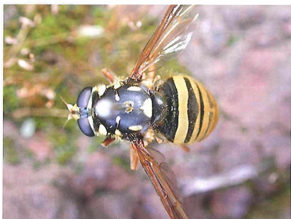
Fig. 1. Top view of the female Temnostoma meridionale (7.VI.2013, Ethe, Vallée de Laclaireau). Note the semicircular yellow spot at the hind end to the scutum.